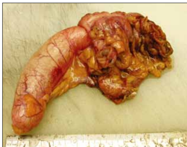
Figure 2. The tumour specimen shows the grossly dilated appendix.

A colonoscopy was performed but showed no intraluminal mass lesion. Extra-luminal compression on the ileo-caecal region was noted. The patient subsequently underwent laparoscopy, which confirmed the appendix to be grossly enlarged. A limited right hemicolectomy was performed. Pathological examination confirmed gross dilatation of the appendix which was filled with mucin (Figure 2). Histological examination revealed that part of its epithelial lining was replaced by mucin-containing granulation tissue and macrophages. The