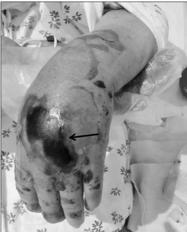
Figure 1. The left hand of an 80-year-old woman taken approximately 4 days after contrast medium extravasation. Severe soft tissue swelling, excoriation, and skin necrosis (arrow) of the dorsal left hand are seen.

The rate of CM extravasation is between 0.25% and 0.9% in adult patients in whom automated mechanical injectors are used for rapid bolus CM injection. 5 The mechanical injection of CM using an automated power injector was shown to be responsible for the increasing incidence of contrast extravasation. 1,3,4 Other factors related to extravasation are use of an indwelling intravenous line, metal needles, injections through a dorsal vein of the big toe or the dorsum of the hand, and tourniquet use. 8 Patient factors related to extravasation are arterial or venous insufficiency, poor lymphatic drainage, oedema, low muscle mass, and subcutaneous