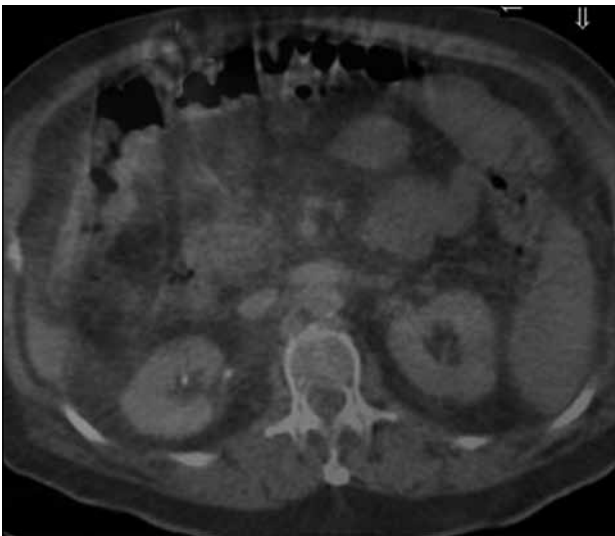
Figure 3. Axial single-photon emission computed tomography / computed tomography image shows the linear activity in a recanalised umbilical vein.

In our case, there was a linear accumulation of Tc-99m MAA in the right paramedial region on planar and SPECT/CT scan consistent with uptake in the recanalisation of the umbilical vein. Umbilical vein recanalisation occurs in about 9% of patients with portal hypertension 13,14 or abnormal venous drainage of the liver. During fetal development, the umbilical vein directly communicates with the sinus venosus