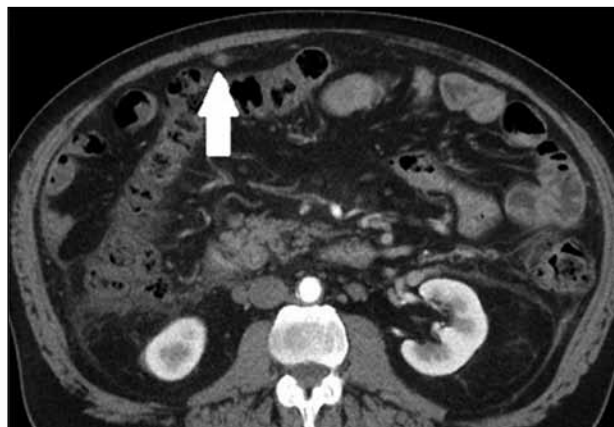
Figure 1. Axial triphasic computed tomographic scan of the abdomen shows a dilated vascular structure in the falciform ligament (arrow).

Three weeks after the triphasic CT scan, an angiogram was performed. The results showed normal hepatic artery anatomy without accessory or replaced hepatic artery from the superior mesenteric artery. We administered 159 MBq (4.3 mCi) Tc-99m MAA via the hepatic proper artery. Apart from uptake in the liver tumours, there was a linear pattern of tracer activity in the right paramedian region (Figure 2). The uptake was confirmed to be in the recanalised umbilical vein