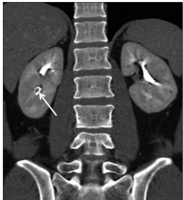
Figure 2. Coronal reconstructed image of the excretory phase of contrast-enhanced computed tomography showing a small, low-attenuating nodular lesion within the mid-posterior calyx of the right kidney (arrow).