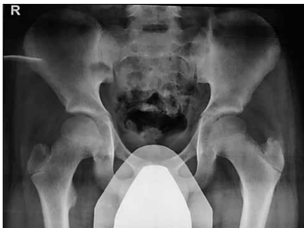
Figure 1. Pelvic radiograph of boy with newly developed testes shield. Although the actual positioning of the shield is unsatisfactory, the image quality is diagnostically acceptable.