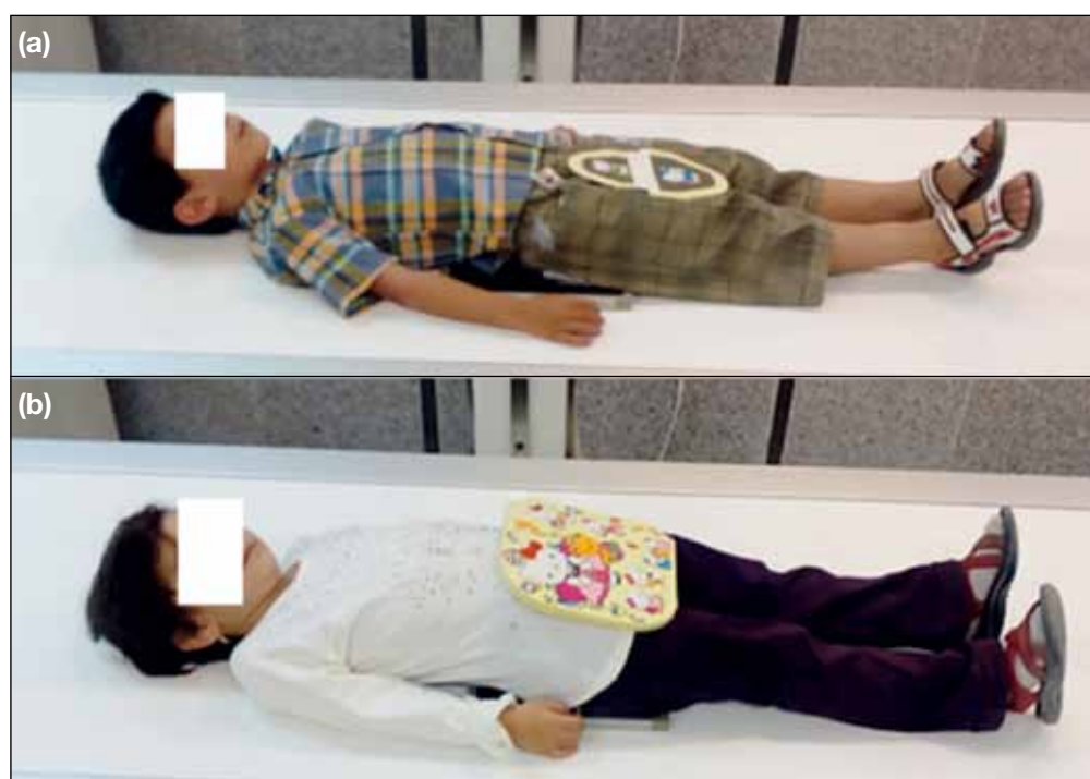
Figure 3. Bismuth radioprotective gonadal shields in boy (top) and girl (bottom) subjects.

The low adherence rate of radiographers applying lead shields is reported to result from the complexity in identifying gonadal position in relation to surface landmarks and the risk of obscuring bony structures. 5,24,25 Our developed bismuth ovarian shield protects the ovaries, colon, and pelvis bone by covering the entire pelvic region. Because bismuth shields can be placed more easily without concern for obscuring diagnostic features, these developed shields are easier to use, especially in crowded and emergency radiology centres. An example of bismuth radioprotective gonadal shields in boy and girl subjects is presented in Figure 3. Its applicability for patients with diagnosed or suspected sacral trauma is an added benefit. Although radiographs of girls with gonadal shields were noisier than those of girls without, the quality of both remained diagnostically acceptable. Training to improve the skills and qualifications of radiographers is key to improving accurate positioning of gonadal shields for boys undergoing pelvic radiography.