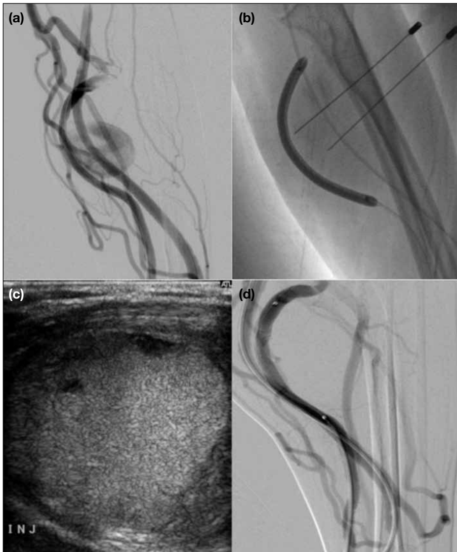
Figure 4. Second procedure. (a) Fistulogram showing residual pseudoaneurysm prior to second thrombin injection. (b) Fluoroscopic image of balloon-assisted direct percutaneous thrombin injection. (c) Ultrasound image showing complete filling of pseudoaneurysm with thrombin. (d) Post-procedure fistulogram showing minimal residual neck.

Should arterial access be used for venous angioplasty in cases of AVF-associated venous limb stenosis, it is essential to select access sites in proximity to anatomical bone landmarks since compression of an arterial access site against underlying bone is more likely to result in successful haemostasis than compression against underlying soft tissue.