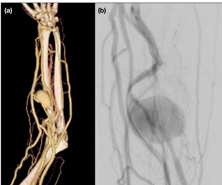
Figure 2. Radial artery pseudoaneurysm. (a) Three-dimensional volume-rendered computed tomography angiogram image and (b) fistulogram showing left radial artery pseudoaneurysm in proximal forearm.