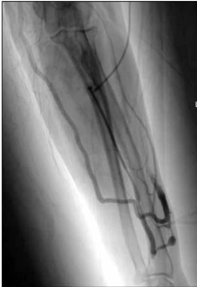
Figure 1. Arterial access site in mid-forearm. Fistulogram prior to venous angioplasty showing site of vascular access in left mid-forearm.

After obtaining informed consent, ultrasound-guided direct percutaneous thrombin injection was performed via a 5- × 80-mm angioplasty balloon catheter (POWERFLEX Pro; Cordis, Fremont [CA], United States) positioned and inflated across the neck of the pseudoaneurysm. Three 22G spinal needles were inserted under ultrasound guidance into the pseudoaneurysm sac